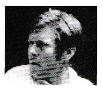
Men's Grand Prix Winner 1970 CLIFF RICHEY